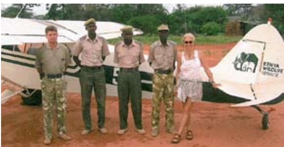
Patty Wagstaff with KWS pilots. Read more about this exciting work on our web site at www.lindberghfoundation.org , and click on the article in the News & Events section.

“Working with the Kenya Wildlife Service Air Wing has been one of the most rewarding experiences of my life,” said Patty Wagstaff. “Their excellent pilots appreciate the need for recurrent and aerobatic training and believe, as I do, that aerobatic lessons make all pilots more skillful, more confident and safer aviators, and gives them better tools to be able to combat elephant and rhino poaching in Kenya.”