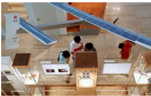
Solar Impulse on exhibit at the Olympics in Beijing, China. August 2008.

Not far from the “Bird’s Nest” Olympic stadium, the current project of 2005 Lindbergh Awardee Dr. Bertrand Piccard and his business partner André Borschberg is on display.